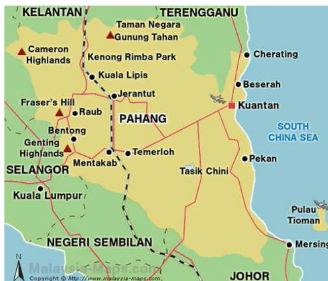
Fig 1. Map of Pahang State, Peninsular Malaysia