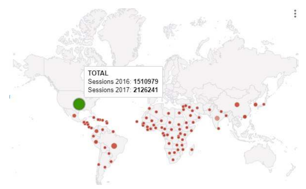
Figure 1. Increased usage of DOAJ by users in the Global South after starting the ambassador programme. The size of the dots is proportional to the amount of increase