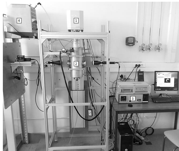
Fig. 2. Sorption isotherm device with: 1-Magnetic suspension balance; 2-Heating jacket enclosing the measuring chamber; 3-Humidity generator; 4-Shiller for temperature control.

Since the products might depict hysteresis behaviour, both sorption and desorption were studied: the tests were performed from 15% RH up to 75% RH in steps of 15% at 35°C for sorption. The same protocol was applied in desorption from 75% RH down to 15% RH. The oven-dry mass of each sample was determined after the experiment. For this purpose, lignocellulosic products were oven dried at 103 ( \pm 2 °C) until equilibrium. Mineral materials were submitted to a flow of dry air at 35°C (dew point of -30°C) until equilibrium to avoid possible volatilisation of chemicals.