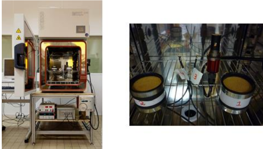
Fig. 3. (a) General view of the experimental device (left) and (b) sample holders inside the chamber (right).

measures the evolution of RH and temperature. In this study, a RH step from 40% to 60% was applied at 35°C. Additional information on this device and protocol can be found in [1].