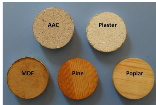
Table. 1. Average of density and thickness of the disk-shape samples. For poplar and maritime pine, the density value is the basic wood density

The building materials tested in this study are autoclaved aerated concrete (AAC), plaster plate (BA13) whose cardboard layer has been removed, medium density fibreboard (MDF), and two wood species, maritime pine ( Pinus pinaster ) and poplar ( Populus euroAmericana 'koster' ), both oriented in tangential direction. The choice has been made to study both mineral and lignocellulosic materials in order to have a large diversity of hygroscopic behaviour. For each material, two disk-shaped sample with a diameter of 72 mm were cut to duplicate the experimental data (Fig. 1). The mean thickness and density of these samples are presented in Table. 1. Note that the basic wood density (oven-dry mass to green volume) is indicated for wood samples. Small cuboid shape samples (less than one cm 3 ) were cut to determine the sorption isotherms. More details about the sampling and measurement protocols can be found in [1, 7].