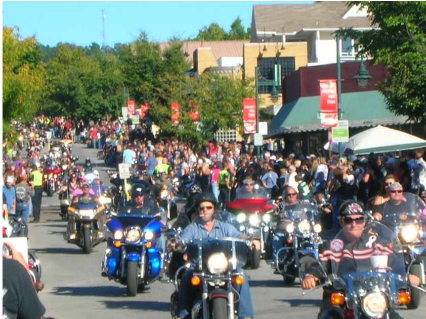
Figure 1 Parade of Power

Approximately how many hours do you ride a motorcycle a week? 5 Approximately, how many hours do you work on your motorcycle(s) a month? 1 Roughly, what percentage of your friends have motorcycles? 10 % Does your job involve motorcycles? Yes No Write the name of your favorite motorcycle related brand: HARLEY DAVIDSON Answer these next questions thinking about your favorite motorcycle related brand.