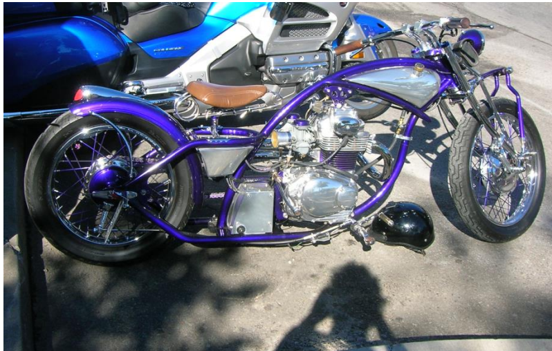
Figure 4 Community of practice motorcycle