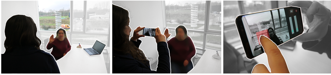
(a) A person, a computer screen, a fan, objects passing by the window are source movement sources. (b) The user chooses a movement (c) The user selects a region on the touchscreen