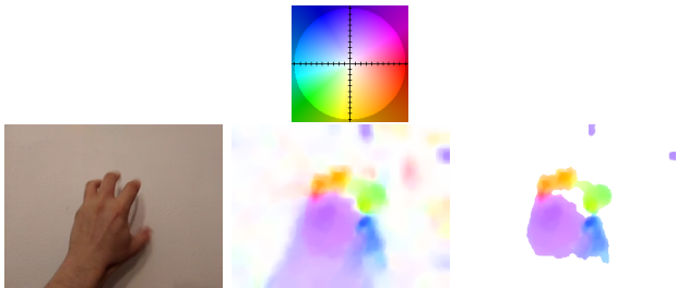
Figure 2: Color representation of the optical flow. (Top) Color space: hue indicates direction, saturation indicates amplitude. (Bottom) Grasp gesture, estimated flow, filtered flow

Optical flow is the distribution of apparent velocities of moving brightness patterns in an image [6]. The movement indicates a motion resulting from the relation between captured objects and the viewer. The motion at a point can be represented with \Delta x and \Delta y , the horizontal and the vertical displacement respectively. Therefore displacement vector can be expressed as v(\Delta x, \Delta y) , but also in polar coordinates v(r, \Theta) to represent the amplitude and the direction of the movement for a pixel. Fig. 2 shows a color coded representation of the optical flow.