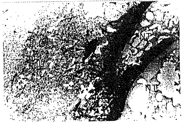
Figure 2. Histological section of a non-treated bone allograft (dark) after a four-week implantation time. The implant is fragmented by the resorption process (➤) and separated from the recipient bone by a connective tissue (IT) constituted of plasmocytes and lymphocytes (black dots) suggesting a strong immunitary reaction against the implant. Pores are filled by necrotic tissue remnants (NT).

The material pores were invaded by a highly vascularized stromal tissue containing some plasmocytes and lymphocytes. Non treated implants were separated from the recipient bone by a thick layer of connective tissue which entered in the pores of the implant. This connective tissue contained many plasmocytes and lymphocytes. Most of the pores were invaded by this immune cells infiltrate indicating a strong immunological reaction against the implant (Fig. 2). It was interesting to notice that the internal pores that were not filled with this infiltrate were filled with remnants of necrotic donor tissue.