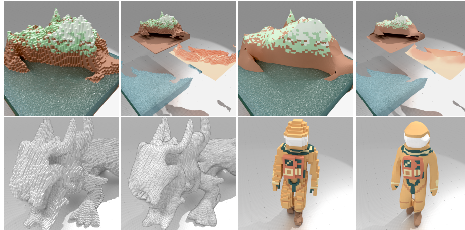
Figure 1: First row, from left to right: input voxel art decomposed into two labels (sea, island, 64 \times 68 \times 40 ) and three interfaces, piecewise smooth regularization with consistent interfaces between labels. Second row: high resolution regularization and low resolution voxel art reconstruction.

Jacques-Olivier Lachaud Université Savoie Mont-Blanc