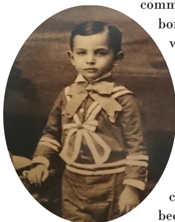
Antonis Benakis as a child, hero of Penelope Delta's book Trelantonis ( Crazy Anthony)

Located Boulevard Haussmann in Paris, the Jacquemart-André museum is the result of the shared passion of a couple, Nélie Jacquemart and Édouard André. André, first engaged in the Army and then in politics, was the heir of a Protestant banking family. Passionate about art, he began his collection in the 1860s and married Nélie Jacquemart, a young painter sharing his passion. Together, they built a mansion Boulevard Haussmann designed to host their collections. It was then donated to the Institut de France to be transformed into a museum. In the Marais, the Cognac-Jay museum is also the result of a shared passion: Théodore-Ernest Cognacq et Marie-Louise Jaÿ are the founders of the famous La Samaritaine, one of the first Parisian department stores (les Grands magasins ), founded in 1870. Both came from very modest families from the Atlantic coast—Théodore-Ernest Cognacq was born on the island of Ré—and the Alps, Marie-Louise Jaÿ being born and raised in Samoëns, a Savoyard village where she also created a beautiful botanical garden. In Manhattan, Henry Clay Frick, an American industrialist who founded one of the major coke and steel manufacturing companies and signed a partnership with Andrew Carnegie. The H. C. Frick & Company was providing coke for Carnegie's steel mills. The partnership between H. C. Frick & Company and Carnegie Steel Company was the predecessor of U.S. Steel that is still today the 15 th largest steel producer.