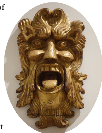
Gilded wood-carved head of anthropomorphic monster. Element of church decoration. Zakynthos, Ionian islands, 19 th century

The Benaki museum is a remarkable institution for several reasons. Founded by one man, Antonis Benakis, an Art collector passionate about his country and willing to show the world its wonders all along the historical vicissitudes and cultural metamorphosis, it has become a network of museums displaying all aspects of Greek culture, from toys to contemporary architecture, acknowledging the links and contributions of all the influences and cultures that were part of the country's history and cultural development from the most remote prehistoric times. The cooperation of other private public-benefit foundations, regular donations and the reputation of the institution resulted in a continuous increase of the collections and of the number of visitors. It certainly is one of the most important museum worth discovering in Athens ■