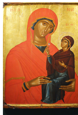
Saint Anne with the Virgin, attributed to the workshop of Angelos Akotantos, Mid-15 th century