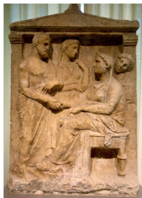
Attic marble grave stele, from Keratea, 4 th century BC (JB)