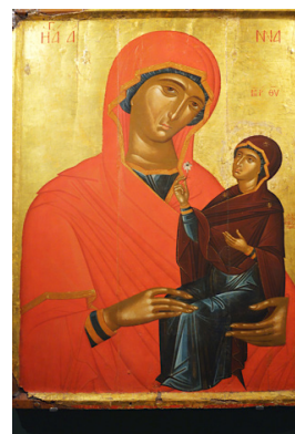
Saint Anne with the Virgin, attributed to the workshop of Angelos Akotantos, Mid-15 th century