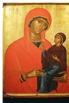
Saint Anne with the Virgin, attributed to the workshop of Angelos Akotantos, Mid-15 th century