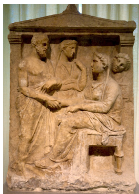
Attic marble grave stele, from Keratea, 4 th century BC (JB)