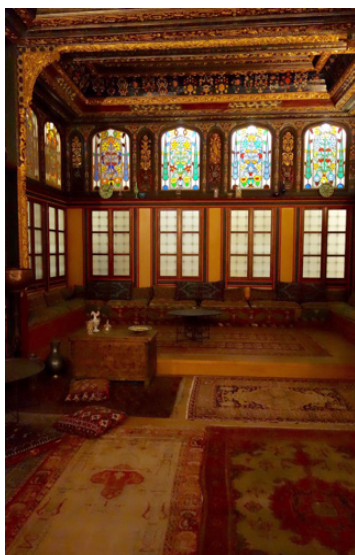
Wood-carved reception room from a mansion in Kozani, mid-18 th century

Icons, paintings, textiles and objects from the Byzantine and the Ottoman periods remind us that Greece has always been at the heart of the Mediterranean roads of commercial and cultural exchanges. Christian traditions diverged from the Western Roman Christian Church and culture, with the founding of the Eastern Roman Empire, which extension covered the territories all around the Mediterranean sea including Egypt and North-East Africa, and later the establishment of the Byzantine Church. Greek byzantine art was then also influenced by Islamic art and traditions, with the Persian, Arabs and Ottoman attacks that slowly dismantled the Eastern Roman Empire between the 7 th century and the final fall of Constantinople in 1453.