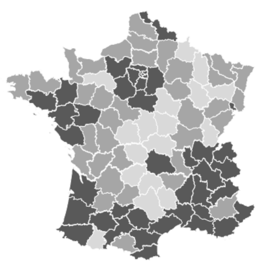
Figure 2 – spatial dynamics

The spatial dynamics can be divided into 3 groups, which will be taken from Essafi, Languillon and Simon, 2017<sup>9</sup>. The segmentation by price highlights three groups: group 1 next to Paris or around the Mediterranean Sea with a dynamic demography, group 2 around the frontier or closed to the group 1, and group 3 in the center or in the North-East of France which is more rural and where the population is declining.