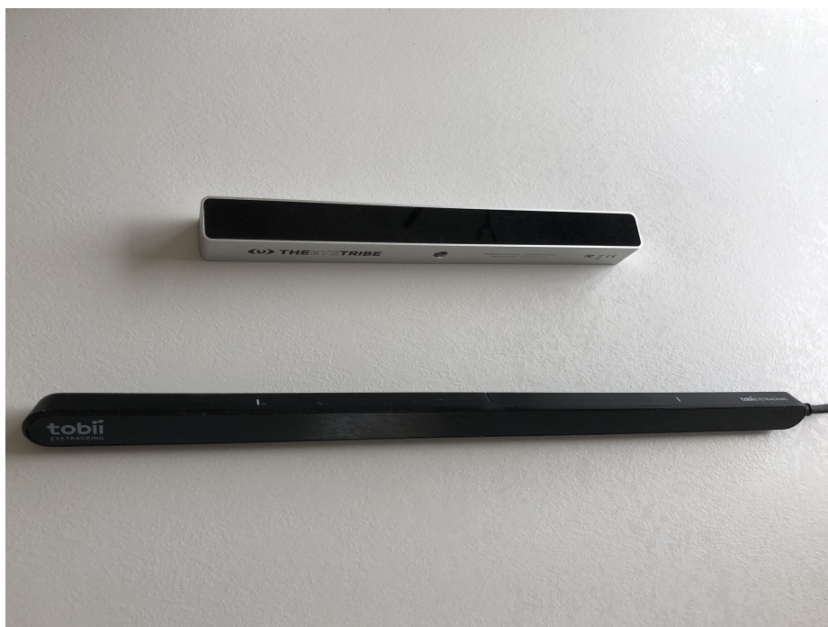
Fig. 1. Two of the eye-trackers which permit to play with GazePlay: the Eye Tribe upper side, the Tobii 4C bottom side

In 2013, the Eye-Tribe company was the first to extremely lower the cost by creating cheap and more affordable eye-trackers with an elegant Java API and compatible with both Windows and OS X. Tobii, the most important firm to sell eye-trackers released their EyeX (2014, \simeq 100€) followed by the Tobii 4C (2016, \simeq 160€) and their C++ library. While the Eye-tribe was sold to Facebook for its Oculus division and is no longer developed, Tobii works a lot on their low-cost eye-trackers and their associated tools (multiple users, gaze trace, etc. ).