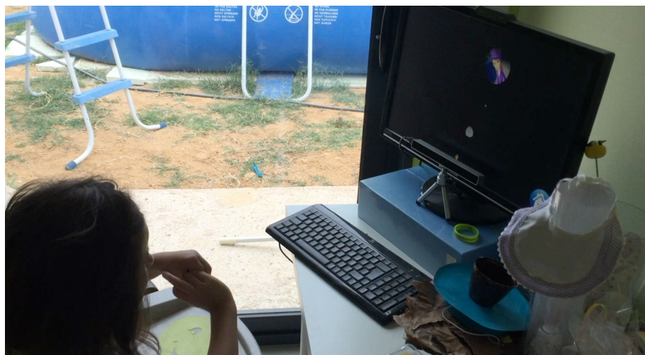
Fig. 3. A child who plays the creampie game with an Eye Tribe tracker.

GazePlay 1.3, gathers 17 playable games 6 . For each one, we aim to develop one or several skills for the children. We can consider that three kinds of skills are developed in GazePlay: action-reaction, selection, memorization skills.