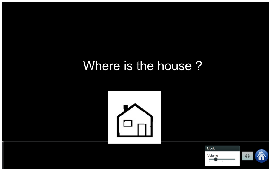
Fig. 4. Screenshot of the game where is it? , the question is asked associated to a pictogram from Makaton vocabulary [2].

In other games, we aim at working on long-term memory. In the game Where is the animal? , a sentence is pronounced and written to indicate to the player which animal to find (horse, dog, crocodile,...) and then several photos of animals are shown (from 4 to 9 according to the child/helper choice). Player selects photos until (s)he finds the correct one. The same game is proposed with colors. An additional one is completely configurable ie. parents/therapists can build their own games with their own photos. The sentence can be completed with pictograms for instance to teach them to the children (see figure 4). This game and the use of pictograms was inspired by the community (see section 4).