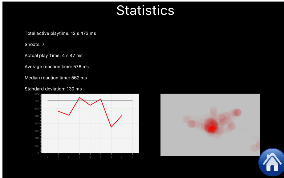
Fig. 5. Screenshot of statistics for an action-reaction focused game.

playtime, actual playtime, durations, reaction length, standard deviation, etc. A heatmap also shows gaze position on the screen. With these statistics, helps get objective information to evaluate motivation and/or evolution of children.