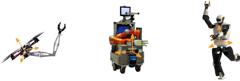
Fig. 2: Three different multi-joint mobile robots at LAAS: the flying manipulator Aeroarm (left), the mobile manipulator Jido (center), and the humanoid robot Talos (right). The usual choices for their root frame placement are displayed.

its dimension is imposed by the nature of the system. The control input \mathbf{u} \in \mathbb{R}^m describes the rudders thanks to which the system can be driven and the output \mathbf{y} \in \mathbb{R}^p is the vector of data provided by sensors. Using this formalism, the state-space representation of the system is given by :