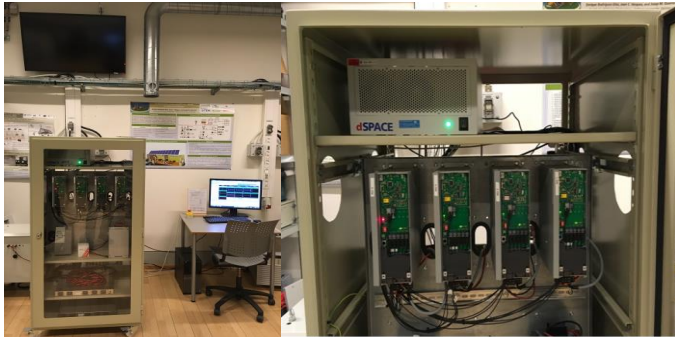
Fig. 1. Microgrid emulation module for experimental tests ( Microgrids group, Aalborg University )

The core (and novelty) of the presented proposal is the inclusion of an extra energy storage (operating reserve), which is not ‘seen’ by the EMS. This element allows all the dispatchable resources in the microgrid to be optimally scheduled. This is achieved thanks to the compensation role assumed by this new element when net-demand deviations (from forecasted values) occur. Given the expected reduced-size of this unit (compared to the main energy storage), its technology can be chosen so that its cycling life is high enough as to consider its marginal cost negligible (i.e. supercapacitors/flywheels [5]). Deviations in ND are reflected as changes on the state-of-charge (SoC) of the OR which are included in the optimization process of the EMS every timestep t . The required capacity of this OR unit is also recalculated every timestep t , based on uncertainty estimations for the next timestep. When uncertainty is such that the total OR capacity is not required for compensation purposes, part of the OR capacity can be assigned to the system to be used as part of the main energy storage, increasing its capacity factor and providing the microgrid with a temporary extra-storage capacity. Net-demand uncertainty estimations are obtained using an analog ensemble method, which is also presented in this work.