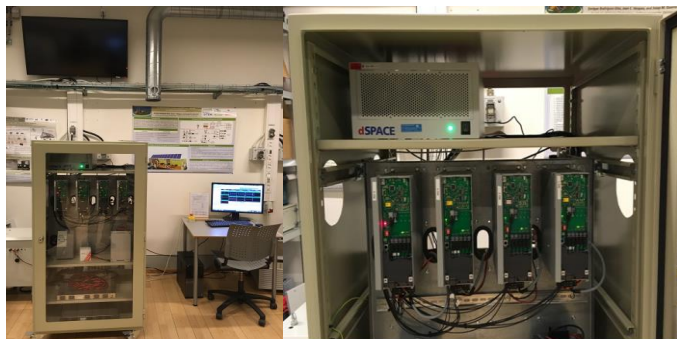
Fig. 1. Microgrid emulation module for experimental tests ( Microgrids group, Aalborg University )

The core (and novelty) of the presented proposal is the inclusion of an extra energy storage (operating reserve), which is not ‘seen’ by the EMS. This element allows all the dispatchable resources in the microgrid to be optimally scheduled. This is achieved thanks to the compensation role assumed by this new element when net-demand deviations (from forecasted values) occur. Given the expected reduced-size of this unit (compared to the main energy storage), its technology can be chosen so that its cycling life is high enough as to consider its marginal cost negligible (i.e. supercapacitors/flywheels [5]). Deviations in ND are reflected as changes on the state-of-charge (SoC) of the OR which are included in the optimization process of the EMS every timestep t . The required capacity of this OR unit is also recalculated every timestep t , based on uncertainty estimations for the next timestep. When uncertainty is such that the total OR capacity is not required for compensation purposes, part of the OR capacity can be assigned to the system to be used as part of the main energy storage, increasing its capacity factor and providing the microgrid with a temporary extra-storage capacity. Net-demand uncertainty estimations are obtained using an analog ensemble method, which is also presented in this work.