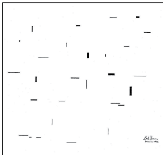
Figure 1. Earle Brown, December 1952