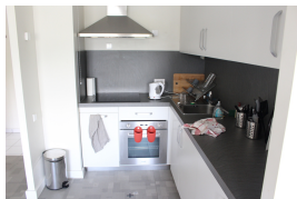
Fig. 1. Instrumented kitchen.