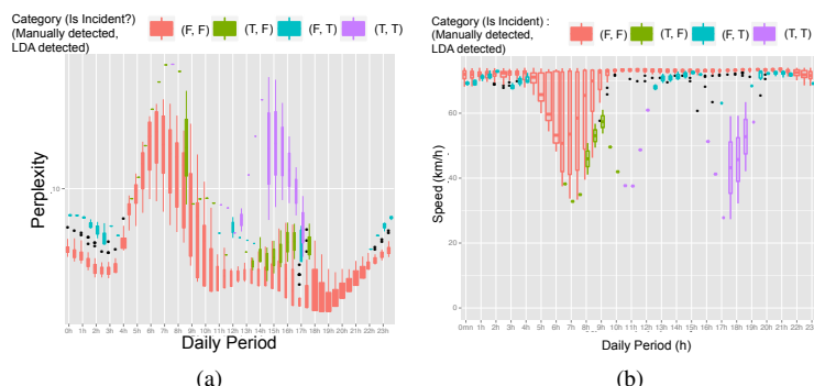
Fig. 2: Perplexity (logarithmic scale) (a) or Speed (linear scale) (b) distributions on section 175 according to daily periods and detection state (November 2013).

The results of the filter process are exposed on Figure 2 and compared to the ground truth incident identification. For every section, most of the significant incidents are identified. Nevertheless some drawbacks due the choice of a threshold based detection method are to mention. The filter is very sensitive during the free flow time periods and less accurate during traffic peak periods. The association of the perplexity to classification methods could improve the performances. Furthermore Figure 2 highlights the usual behaviour of the sections. During the peak periods (morning), the perplexity logically trends to grow due to the huge variety of speed categories experimented. The incidents occurring during peak period are better identified by the perplexity, but the threshold filter is unable to make the distinction because of the huge variety of states. As the ground truth reference has been manually built, some incidents could be missing. A comparison of the performances to baseline methods is required.