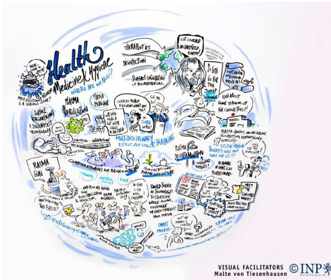
FIGURE 1 Comic of the discussion. Current challenges in the research field “Plasma for Medicine and Hygiene” visualized during the discussions at the workshop

responses of cells, blood, tissues, and bacteria at the interface with the biological environment in vitro (cell culture plates, test tubes), ex vivo (catheters, dialysis systems), and in vivo (prostheses, implantable devices). Success or failure of biomaterials is determined by the response of the biological environment to their surface chemistry and morphology, among other factors. In certain cases, the interactions have to be encouraged but controlled for example, for inducing the osseointegration of an implant in a bone tissue; in others they have to be discouraged and/or fought, for example, for avoiding bacterial colonization of prostheses during and after surgery. In most cases surface characterization and surface modification techniques, plasma processes among them, came useful to address the in vitro responses of biosystems to biomaterials. Translation in vivo is undoubtedly more complicated, as more interactions and reactions (e.g., that of the immune system of the host) have to be controlled.