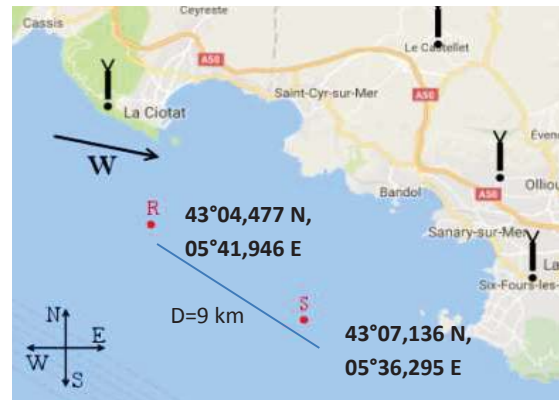
Fig. 1. Top view of the experimental setup measurements region.

Experimental acoustic and environmental data were collected during the three days of ALMA 2015 campaign, making use of the modular array-and-source system ALMA (Acoustic Laboratory for Marine Applications) [20], designed and managed by DGA Naval Systems. It took place in October 2015, in a shallow water environment off the southern coast of France, near the harbor of Toulon. Fig. 1 presents the location of the acoustic projector and of the receiving 10m-high array (64 vertical linear passive array hydrophones (VLA), distributed in depth from 52.5m to 62.3m. The seafloor was roughly flat, with a depth about 100 m, with a sediment cover constantly sandy or gravelly-sandy. During the processed sequence, the calm sea roughness height was about 0.1 m (sea state 1). The source-to-receiver range was about 9.0 km. The source, moored at a depth of 56.2 m, transmitted sequences featuring different narrow- and wide-band codes, among which we considered only Linear Frequency Modulations (LFM) over the of 4 to 6 kHz frequency band; the acoustic signals were sampled at 48 kHz. We have analyzed 50 signals over about two hours, with one transmission every three minutes.