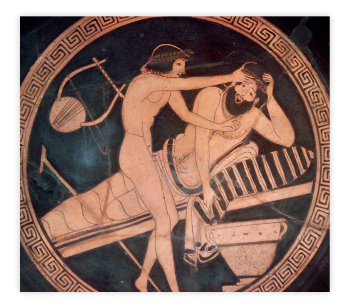
Figure 6: a man, probably drunk, is about to throw up in a krater. He is assisted by a young slave who holds his head. Red figure kylix, Brygos painter, 500-470 BCE, National Museum of Denmark.

But the images in Martial's epigram do not simply follow each other like a series of exercises that the athletes are to complete one after another, in a logical way, as if governed by the rules of a contest. Rather, the epigram's rapid succession of verbs does not give the audience enough time to "observe" a scene, presenting, instead, an accumulation of multifarious actions involving a variety of partners.