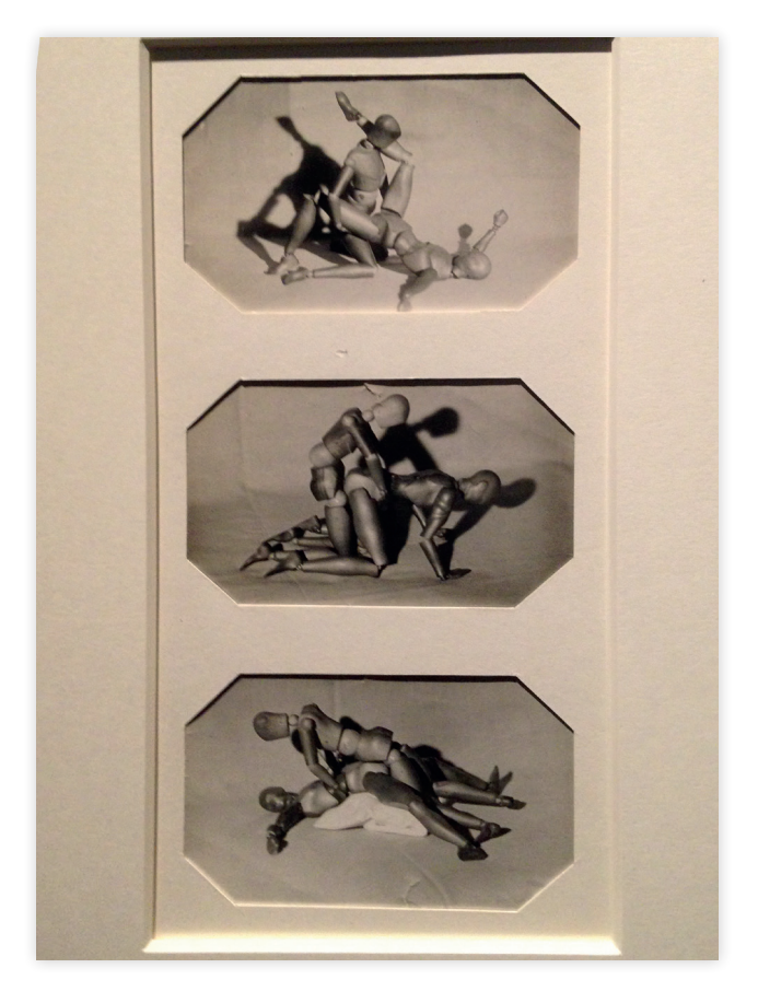
Figure 9: Man Ray, set from the Mr and Mrs Woodman series, 1927.

What is presented here is a picture of a character darting around in every direction, like an uncoordinated puppet. Vomiting precedes the ingestion of food, suggesting that it is all part of an ongoing, rapid cycle. In this epigram, the emphasis is not on the body or gender, but on pure action: one thinks of Man Ray's choice when he developed the series of photo-tableaux entitled Mr and Mrs Woodman ( fig. 9 ): wooden puppets without specific traits to characterize a person or designate a sex.