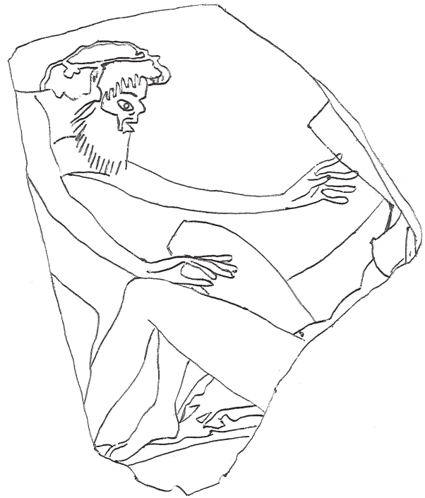
Figure 8: a satyr approaches the crotch of a maenad, who is probably asleep. Fragment of a red figure kylix by the Onesimos painter, 500-490 BCE, Musée du Louvre, G 258.

Similarly, Martial's verses state unequivocally that Philaenis "devours young women's crotches" ( medias