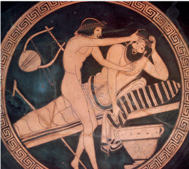
Figure 6: a man, probably drunk, is about to throw up in a krater. He is assisted by a young slave who holds his head. Red figure kylix, Brygos painter, 500-470 BCE, National Museum of Denmark.

But the images in Martial's epigram do not simply follow each other like a series of exercises that the athletes are to complete one after another, in a logical way, as if governed by the rules of a contest. Rather, the epigram's rapid succession of verbs does not give the audience enough time to "observe" a scene, presenting, instead, an accumulation of multifarious actions involving a variety of partners.