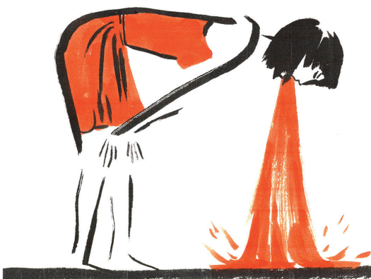
Figure 7: 21 st -Century Philaenis, sequence 7. The character throws up, after drinking three liters of wine. Drawing: Marjolaine Fourton.

[39] These recently discovered frescos from the 1st century CE (62-79) were found in 1985-1987, in exceptionally damaged condition, at the suburban baths of Pompeii near the Marine Gate. One of the seven numbered erotic vignettes shows two women together ( apodyterium , V) and another a scene with four figures including one woman appearing to give cunnilingus to another ( apodyterium , VII). Cf. CANTARELLA 1998 and CLARKE 2003, plates 13 et 15.