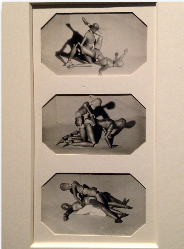
Figure 9: Man Ray, set from the Mr and Mrs Woodman series, 1927.

What is presented here is a picture of a character darting around in every direction, like an uncoordinated puppet. Vomiting precedes the ingestion of food, suggesting that it is all part of an ongoing, rapid cycle. In this epigram, the emphasis is not on the body or gender, but on pure action: one thinks of Man Ray's choice when he developed the series of photo-tableaux entitled Mr and Mrs Woodman (fig. 9): wooden puppets without specific traits to characterize a person or designate a sex.