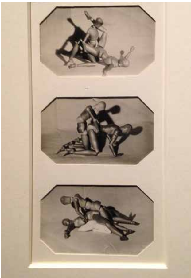
Figure 9: Man Ray, set from the Mr and Mrs Woodman series, 1927.

the moral evaluation of sexual practices rested in the first place on the modalities of those practices. What is poorly regarded is extreme choices: hypersexuality, certainly, is despised and pilloried above all (e. g. to accumulate conquests shows a lack of self-control, an admission of civic weakness), but a citizen who proclaims the importance of chastity and rejects all luxury is not admired either, since complete austerity may be correlated with rejecting the behavior proper to a citizen in society [47]. In all these contexts, the notion of pleasure is to be understood as physical pleasure in general (without distinguishing sexuality from other bodily pleasures). What Romans are concerned with is the control of these practices and pleasures, and therefore the individual's understanding of the norms of masculine civic social life.