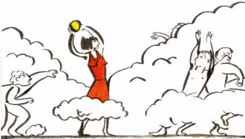
◀ Figure 3: 21 st -Century Philaenis, sequence 5. The character is balancing the weights and preparing to jump.