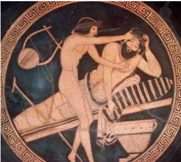
Figure 6: a man, probably drunk, is about to throw up in a krater. He is assisted by a young slave who holds his head. Red figure kylix, Brygos painter, 500-470 BCE, National Museum of Denmark.

athletes are to complete one after another, in a logical way, as if governed by the rules of a contest. Rather, the epigram's rapid succession of verbs does not give the audience enough time to "observe" a scene, presenting, instead, an accumulation of multifarious actions involving a variety of partners.