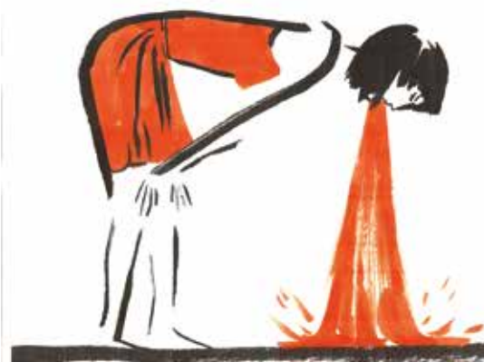
Figure 7: 21 st -Century Philaenis, sequence 7. The character throws up, after drinking three liters of wine. Drawing: Marjolaine Fourton.

[39] These recently discovered frescos from the 1st century CE (62-79) were found in 1985-1987, in exceptionally damaged condition, at the suburban baths of Pompeii near the Marine Gate. One of the seven numbered erotic vignettes shows two women together ( apodyterium , V) and another a scene with four figures including one woman appearing to give cunnilingus to another ( apodyterium , VII). Cf. CANTARELLA 1998 and CLARKE 2003, plates 13 et 15.