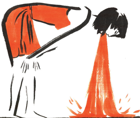
Figure 7: 21 st -Century Philaenis, sequence 7. The character throws up, after drinking three liters of wine. Drawing: Marjolaine Fourton.

[39] These recently discovered frescos from the 1st century CE (62-79) were found in 1985-1987, in exceptionally damaged condition, at the suburban baths of Pompeii near the Marine Gate. One of the seven numbered erotic vignettes shows two women together ( apodyterium , V) and another a scene with four figures including one woman appearing to give cunnilingus to another ( apodyterium , VII). Cf. CANTARELLA 1998 and CLARKE 2003, plates 13 et 15.