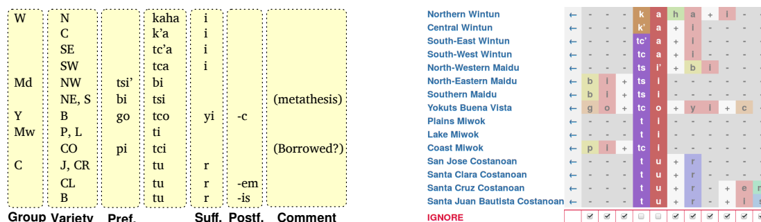
Figure 1: Early alignment example for translational equivalents of “nail” in aboriginal languages of California (based on Dixon and Kroeber 1919), contrasted with a “modern” representation using the EDICTOR tool (List 2017).

The words and morphemes which constitute a language are best modeled as sequences of sounds . Sequences have information content not only from their elements ( segments , whether these are phonemes, graphemes, or morphemes) but also via the order of the elements, a consistent comparison of sequences should account for both order and content. Alignments are a very general way to model differences between sequences. The major idea is to arrange two or more sequences in a matrix in such a way that similar or identical segments which occur in similar positions are placed in the same column of the matrix. If segments are missing in one sequence where no counterpart for a segment can be found, this is represented by a gap character , usually the dash -symbol (List, 2014b).