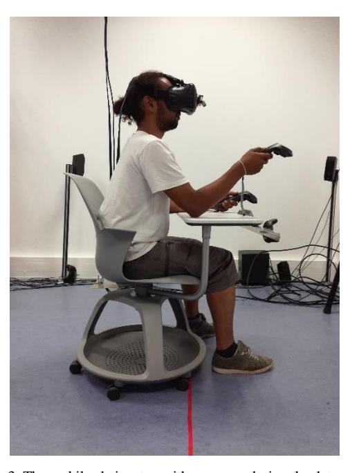
Figure 3: The mobile chair setup with a user exploring the dataset in seated position.

Up to 4 movements modalities are available for navigation. The first is physical displacement while standing up using the HTC Vive head-tracking. Second is the ability to physically move on the platform while seated, rolling the mobile chair over the disk. Third, the user can "fly" the workstation in the direction of the left controller combined with the trackpad input. Fourth, the user can teleport the workstation, by selecting direction and distance of teleportation, the point of arrival being visualized by a semi-transparent duplication of the disk + chair. Switching from flying to teleport is done via the left trigger. And last, pushing left grip button teleports the workstation back to a central position for the user to have the full data visualization in its field of view.