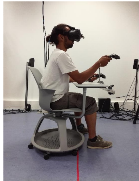
Figure 3: The mobile chair setup with a user exploring the dataset in seated position.

Up to 4 movements modalities are available for navigation. The first is physical displacement while standing up using the HTC Vive head-tracking. Second is the ability to physically move on the platform while seated, rolling the mobile chair over the disk. Third, the user can "fly" the workstation in the direction of the left controller combined with the trackpad input. Fourth, the user can teleport the workstation, by selecting direction and distance of teleportation, the point of arrival being visualized by a semi-transparent duplication of the disk + chair. Switching from flying to teleport is done via the left trigger. And last, pushing left grip button teleports the workstation back to a central position for the user to have the full data visualization in its field of view.