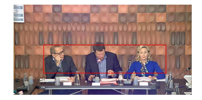
Fig. 2. Search region (Red rectangle)

Color space selection : The second step of the method is to prepare for the light detection stage. To do this, it is