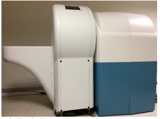
Figure 3: The in-line prototype.

Firstly, a non-uniform intensity transformation is applied to the PET volume to increase the contribution of the low intensity (in order to get the global shape of the small animal). Then a global affine registration is applied, using PCA. Afterwards, the global transformation applied on the original PET is used as an input to the local registration. Normalized mutual information is considered as a metric function for the optimization. Finally, a local deformable registration (B-spline) is used taking the globally registered PET as input. A multi-resolution approach is used in global and local registrations.