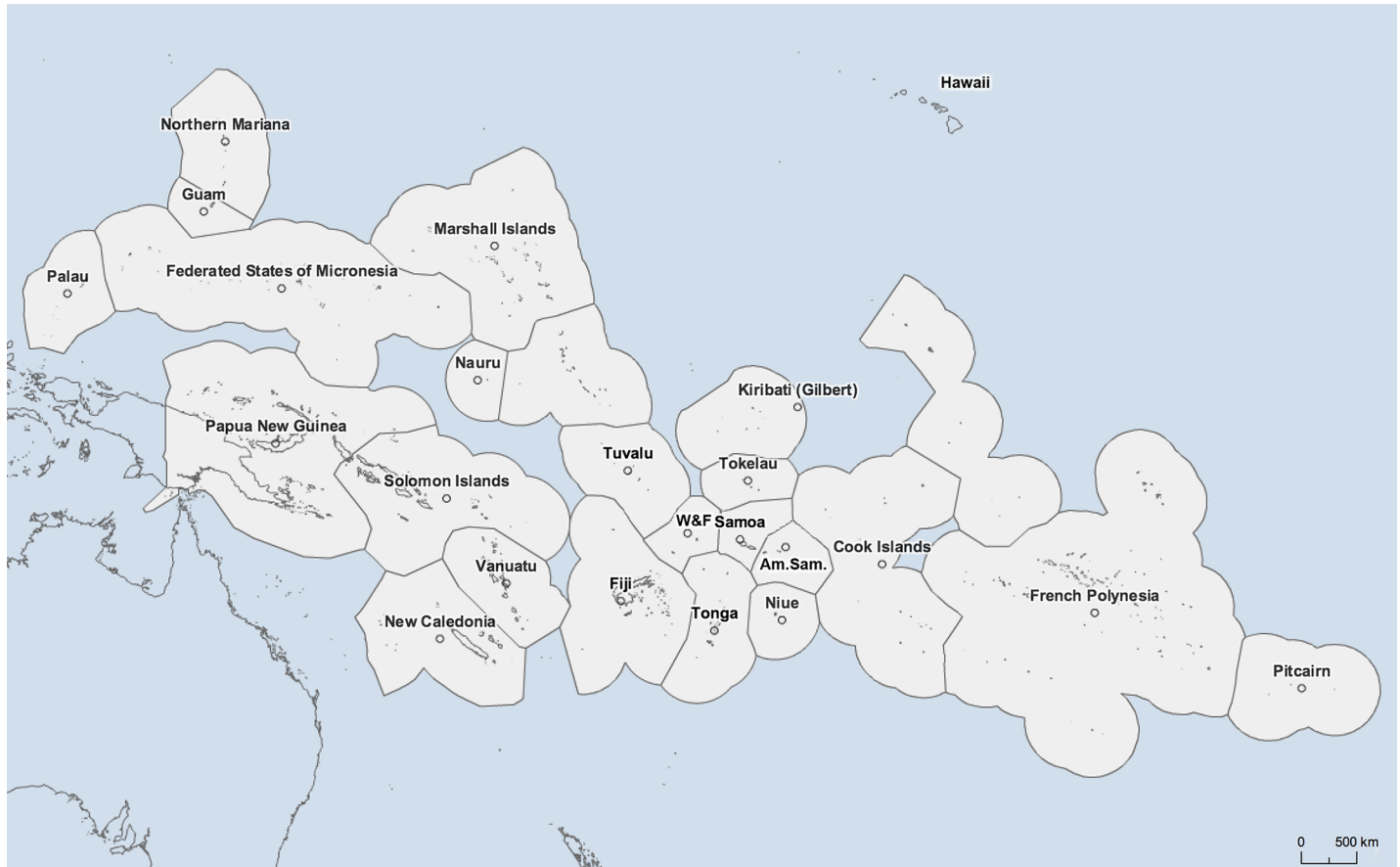
Fig 1. Map of the South Pacific region. All countries in Oceania were included in this review with the exception of Australia and New Zealand. Easter Island does not appear on the map but was included in our study. ‘W&F’: Wallis and Futuna. ‘Am.Sam.’: American Samoa. The map was provided by the Pacific Community (SPC) and is available online at: http://pacific.pogis.spc.int .

https://doi.org/10.1371/journal.pntd.0006503.g001