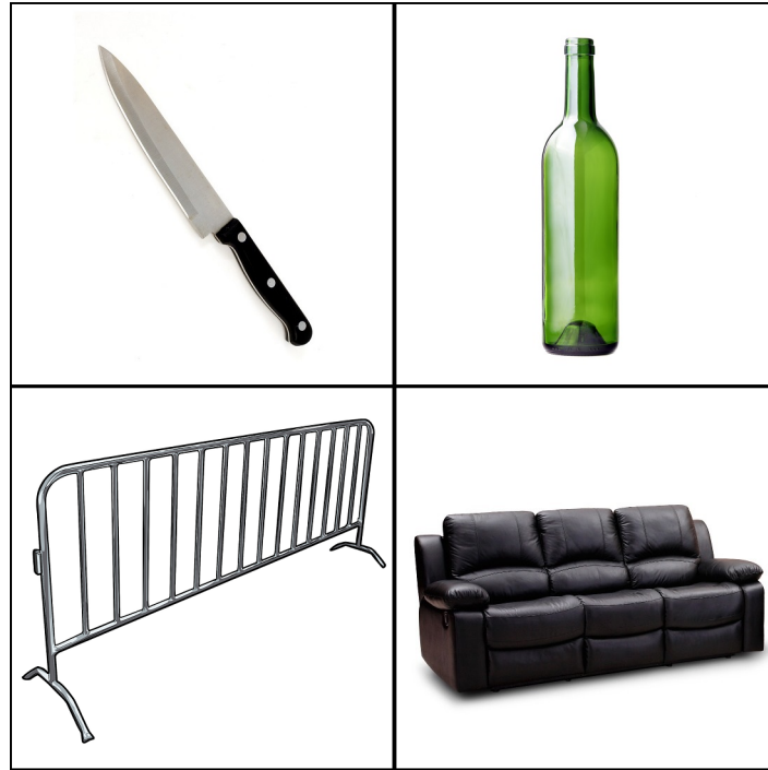
Fig 1. Examples of the kind of pictures used in Experiment 1. knife, bottle, fence and couch.