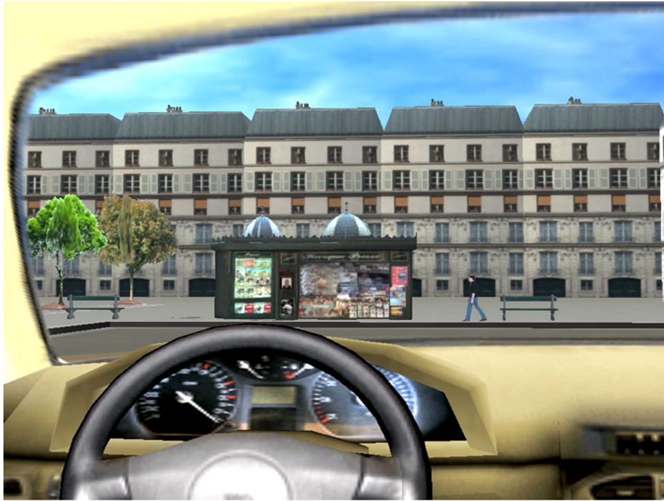
FIGURE 1 | Picture of a specific area of the virtual town (a newsstand, a man and two benches).

The participants were seated in a comfortable chair. The VE was projected 150 cm in front of them.