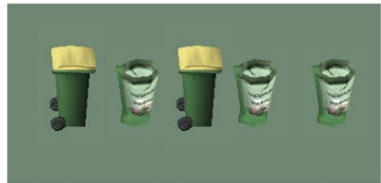
FIGURE 2 | Example of a spatial arrangement of yellow and green garbage containers, all arranged along a straight line.

To be used for the secondary tasks, garbage containers were located on the sidewalks of the road. In the numerical secondary task assumed to interfere with the phonological loop the participants had to memorize the number of garbage containers. The containers were either green or yellow. The participants had to maintain the number of green and yellow