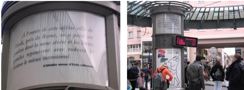
October 2008