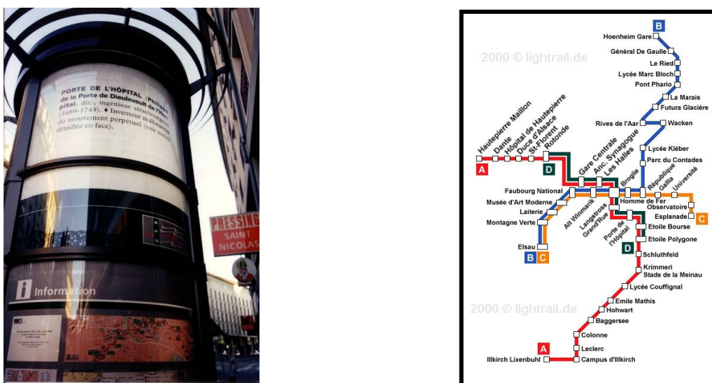
(color should be used for this figure in print)