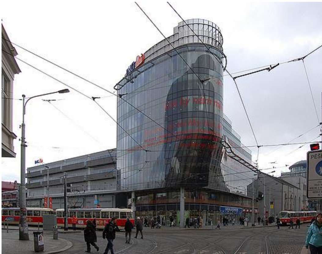
Figure 1: Zlatý Anděl in Prague: A play on the poetic reference