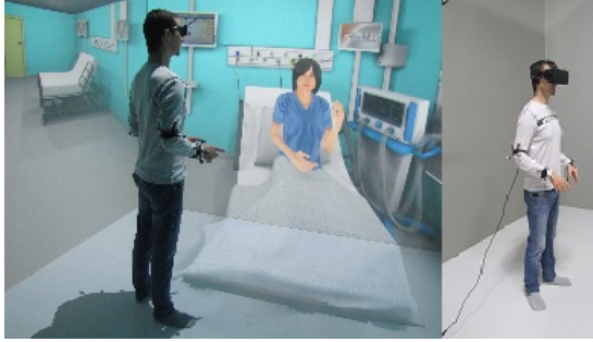
Figure 3: A user interacting with the virtual patient in the CAVE (left) and through the Oculus Rift (right)

ing bad news situation. The system is not self-sufficient: we do not want to provide a mark to the doctor. The objective is for the doctor to debrief with an expert in breaking bad news situation. For this purpose, we aim at providing different tools to facilitate this debriefing between the trainee and the trainer :