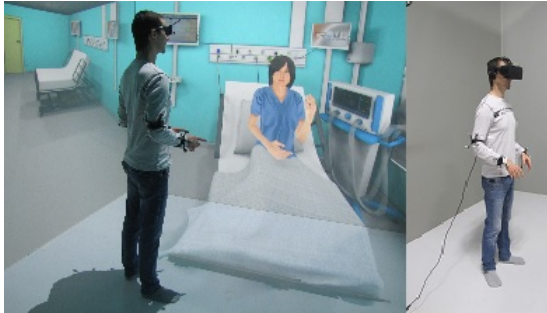
Figure 3: A user interacting with the virtual patient in the CAVE (left) and through the Oculus Rift (right)

ing bad news situation. The system is not self-sufficient: we do not want to provide a mark to the doctor. The objective is for the doctor to debrief with an expert in breaking bad news situation. For this purpose, we aim at providing different tools to facilitate this debriefing between the trainee and the trainer :