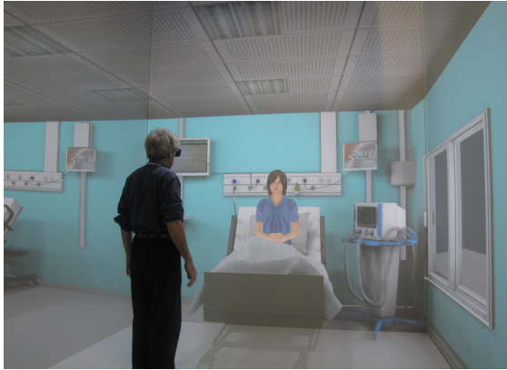
Figure 2: Virtual reality environment