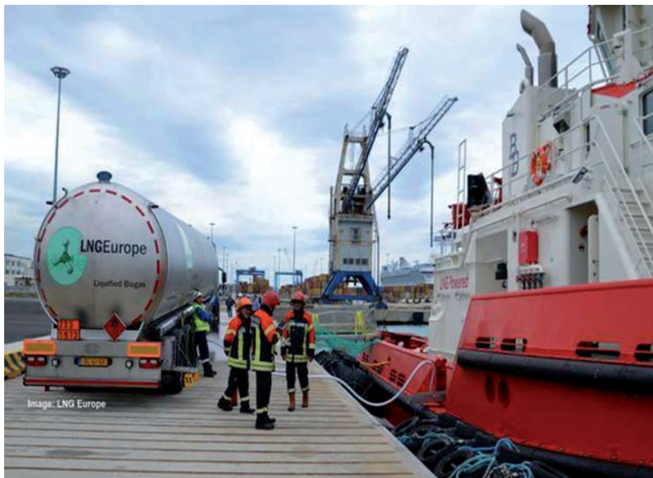
Figure 5 – Bunkering operation of an LNG powered vessel

CNG or 60% that of diesel fuel. 28 This makes LNG cost efficient to transport over long distances where pipelines do not exist. Specially designed cryogenic sea vessels (LNG carriers) or cryogenic road tankers are used for its transport. LNG is principally used for transporting natural gas to markets, where it is re-gasified and distributed as pipeline natural gas. It can be used in natural gas vehicles, although it is more common to design vehicles to use compressed natural gas. Its relatively high cost of production and the need to store it in expensive cryogenic tanks have hindered widespread commercial use.