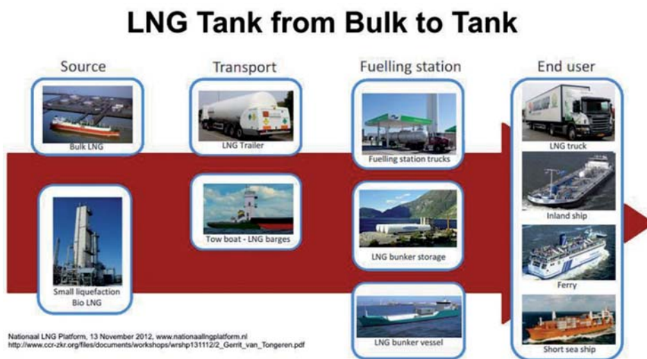
Figure 4 – Actors in the LNG market

with strict terms and structures for gas pricing; only when the customers are confirmed and the development of the respective project is deemed economically feasible, the sponsors of an LNG project would invest their money towards development and operation. Thus, the LNG liquefaction business has been limited to players with strong financial and political resources. Major international oil companies (IOCs) such as ExxonMobil, Royal Dutch Shell, BP, BG Group, Chevron, and prestigious national oil companies (NOCs) such as Pertamina and Petronas are very active in the LNG domain, with a brief summary of actors involved in the LNG market provided in figure 4: