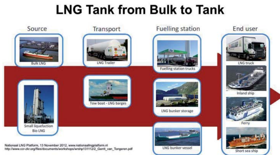
Figure 4 – Actors in the LNG market

with strict terms and structures for gas pricing; only when the customers are confirmed and the development of the respective project is deemed economically feasible, the sponsors of an LNG project would invest their money towards development and operation. Thus, the LNG liquefaction business has been limited to players with strong financial and political resources. Major international oil companies (IOCs) such as ExxonMobil, Royal Dutch Shell, BP, BG Group, Chevron, and prestigious national oil companies (NOCs) such as Pertamina and Petronas are very active in the LNG domain, with a brief summary of actors involved in the LNG market provided in figure 4: