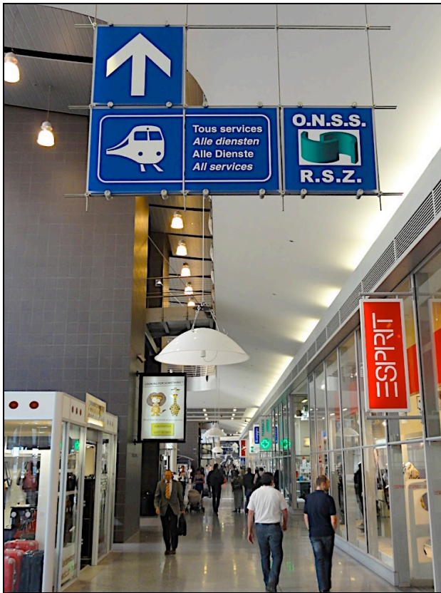
Figure 3. Locustream promenade presented at Brussels international train station during the festival Today Art in 2010.