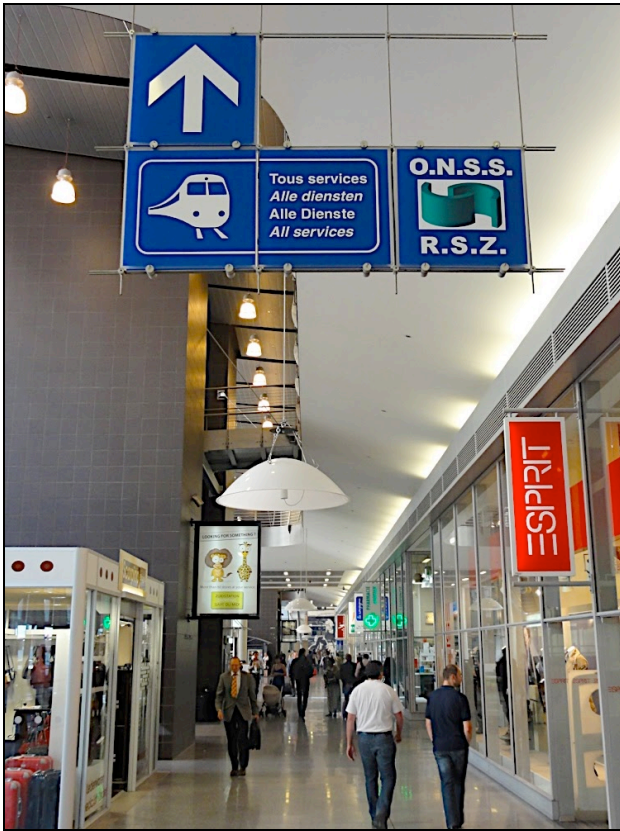
Figure 3. Locustream promenade presented at Brussels international train station during the festival Today Art in 2010.