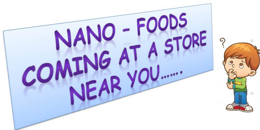
Figure 1. Nano-food products are reaching stores. This image has been modified and designed from a copyright free image source by Nandita Dasgupta – VIT University, India.

Nanotechnology, which is the use of techniques to build nanomaterials, is a fast emerging scientific topic. However nanomaterials are not new, they have always occurred in nature. What is new is the methods that allow to synthesise unprecedented nanomaterials of tailored, fine-tuned properties, thus opening many applications in diverse fields. In particular, the high surface to volume ratio of engineered nanomaterials makes them often more efficient than in nature. Surprisingly, some nanomaterials even exhibit contrasting properties compared to their macro counterpart. While nanomaterials are actually commercialized in various sectors, their use in food industries is still slowly emerging and debated. Results show that nanomaterials improve bioavailability, shelf life and nutrient delivery, they reduce nutrient loss and are essential in active packaging. Active packaging, also named intelligent or smart packaging, refers to packaging systems that help to extend shelf life, monitor freshness, display information on quality, improve safety, and improve convenience. Nevertheless, the potential toxicity of new nanomaterials should be studied before their use in consumer products (Figure 1). This book presents comprehensive reviews on the principles, design and applications of nanomaterials in food, water and pharmaceutical sectors.