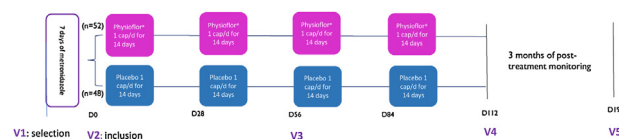
Fig. 1. Study plan.