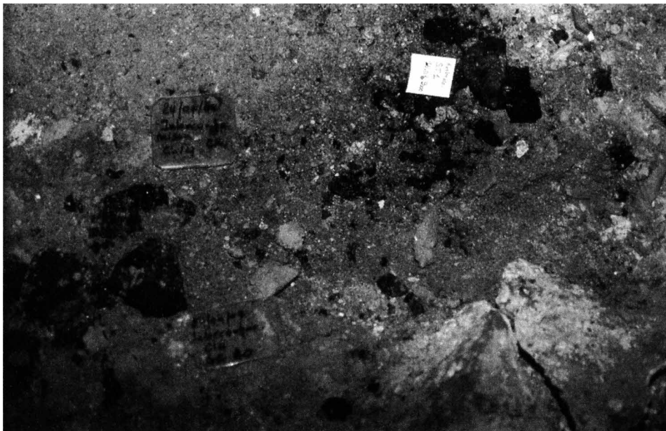
Figure 1 Photograph from the cave floor in the Megaceros gallery showing two of the sampled charcoal pieces

precombustion at 330 °C, or 630 °C in the case of sample GC40. The alkaline fractions resulting from the pretreatment of GC41 and GC42 were also dated by the Groningen laboratory. Thus far, 29 dates have been obtained: 10 each on GC40 and GC41 and 9 for GC42. The ages and key data for the dating process (such as background values, \delta^{13}\text{C} values, and 14 C activities [in pMC] of the samples) are reported in Table 1. The 14 C activities are also plotted in Figure 2.