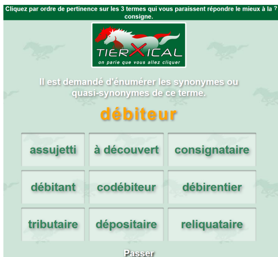
Figure 8: TIERXICAL aims at reordering word associations from the strongest to the weakest. In this example, what are the 3 best synonyms for débiteur (debtor)?

cast, majority voting still presents some important drawbacks.