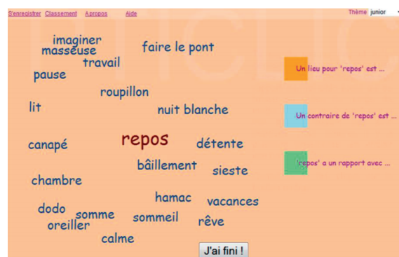
Figure 1: PtiClic: the term repos ( rest ) is the target term. Each term of the cloud should be dragged and dropped in one of the three boxes on the right-hand side.

To our knowledge, very few voting GWAPs exist for language resources creation. Apart from the ones we just mentioned, the only GWAP that relates to this type of game is wordrobe (Bos and Nissim, 2015) 3 . On this platform, players are invited to participate to a variety of tasks, related to semantic disambiguation (noun vs verb, co-reference identification, named entity annotation, etc)