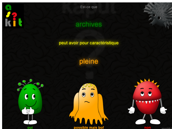
Figure 5: AskIt aims at assessing uncertain semantic relations, especially concerning polysemous words. In this example, can archives have the characteristic pleine (full)?

(as relevant or not relevant) with this game. The accuracy of the results when 3 votes or more were cast is 100%, for 2 votes it is of 95% and 70% for just 1 vote.