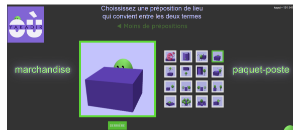
Figure 7: Yakadirou aims at associating prepositions to relations of place. In this example, what is the preposition of place to associate to marchandise and postal parcel ?

Yakadirou (see Figure 7) allows to associated a place preposition to a place relation. For example, in the relation cat r-place sofa what is the most relevant preposition: on, over, under? More than 380,000 bets have been placed in 2 years.