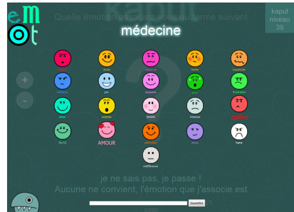
Figure 6: Emot aims at collecting sentiment associations with words. In this example, what are the sentiments that best correspond to médecine (medicine)?

Similarly, Emot (see Figure 5) proposes a target term and a set of emotion/sentiment from which the player has to select the most appropriate (Lafourcade et al., 2016). Since its launch, more than 660,000 emotion/sentiment relations