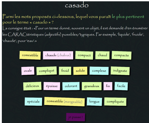
Figure 4: Interface of Selemo. In this example, are the listed characteristics ( edible, hot, delicious, ... ) relevant or not to casado (a Costa Rican dish)?

(as relevant or not relevant) with this game. The accuracy of the results when 3 votes or more were cast is 100%, for 2 votes it is of 95% and 70% for just 1 vote.