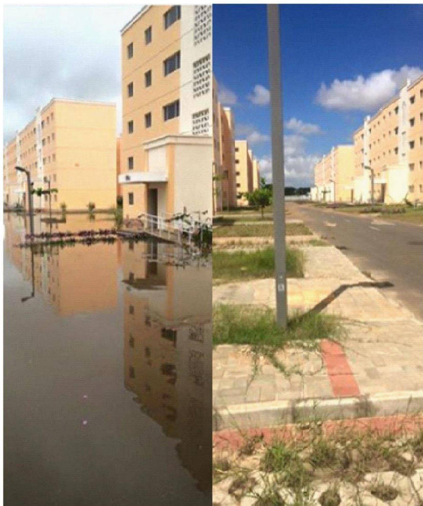
Figure 3: Example of the production of a ‘differential space’ on Facebook

Figure 3a: Denouncing the flood. Figure 3b: Celebrating the intervention of the engineers and state representatives