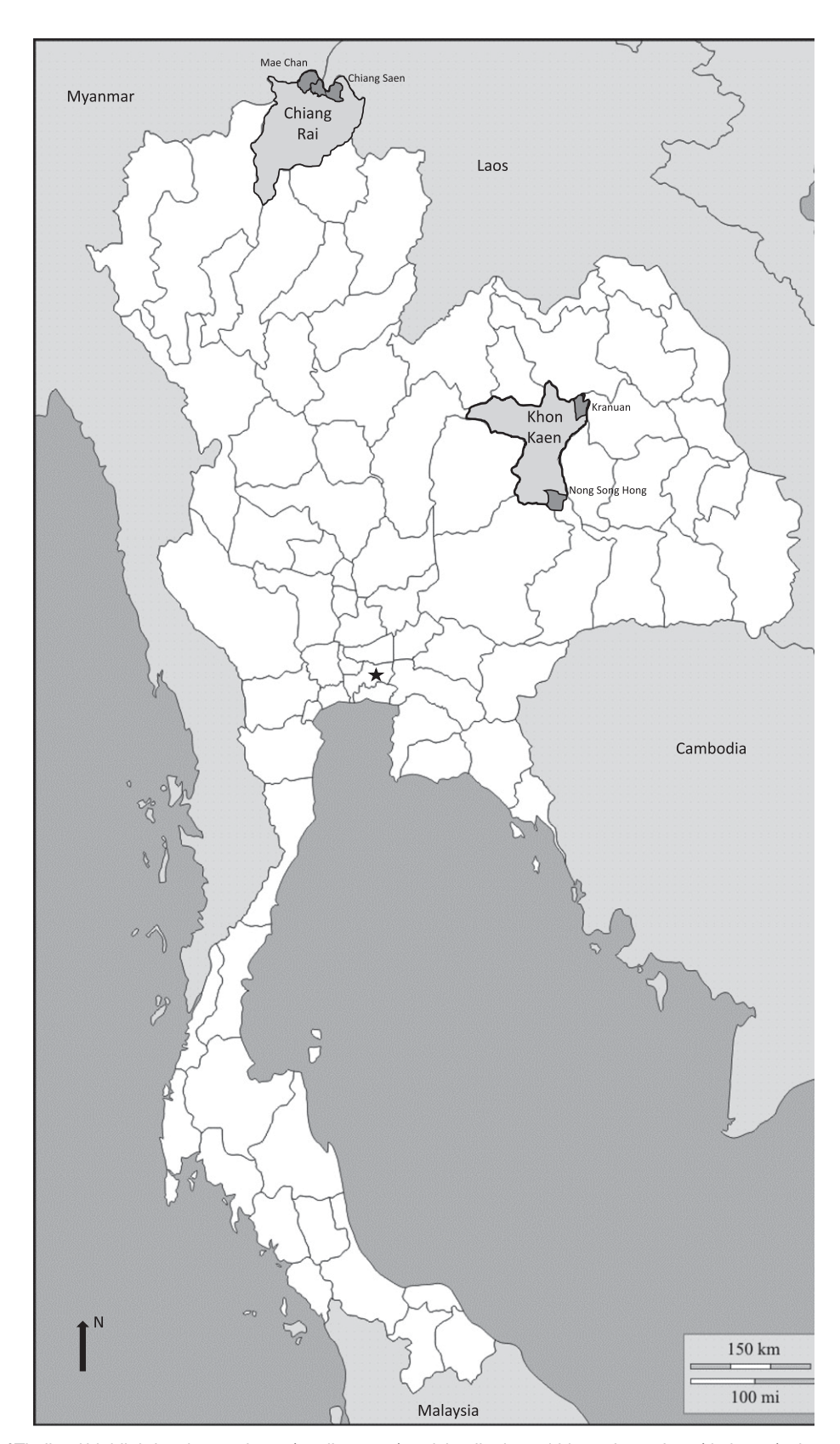
FIGURE 1. Map of Thailand highlighting the provinces (medium gray) and the districts within each province (dark gray) where samples for acute Q fever were tested in an acute febrile illness study—Khon Kaen and Chiang Rai provinces, Thailand, 2002–2005.

IgG phase II antibody titer to C. burnetii antigen between paired sera collected 3–6 weeks apart.<sup>3</sup> Second, the criteria used by the French National Reference Center for Rickettsial