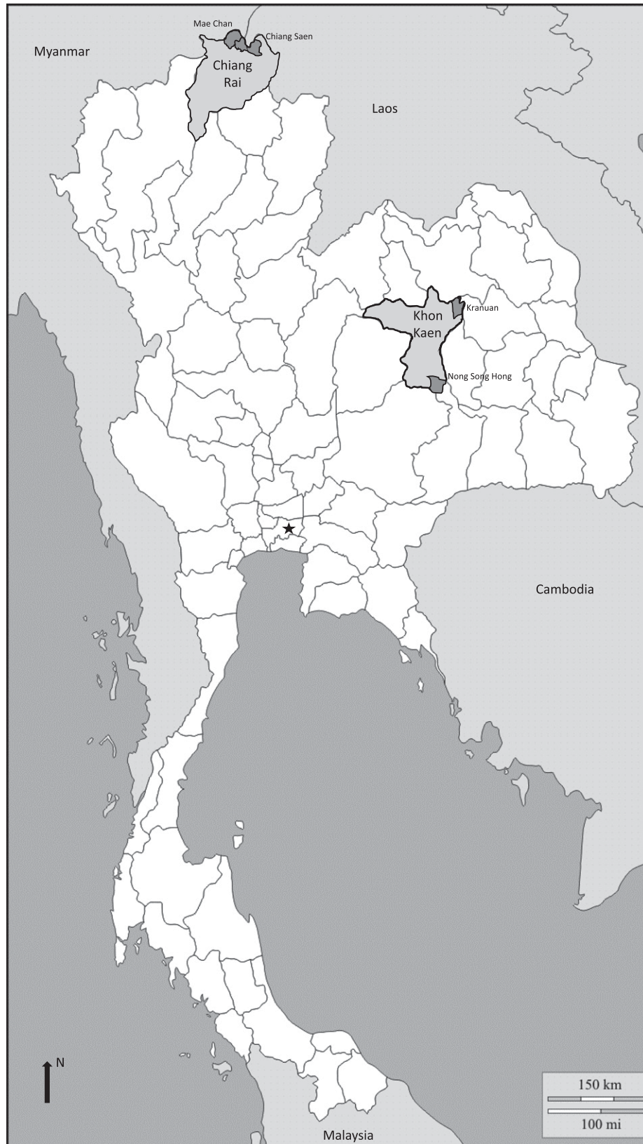
FIGURE 1. Map of Thailand highlighting the provinces (medium gray) and the districts within each province (dark gray) where samples for acute Q fever were tested in an acute febrile illness study—Khon Kaen and Chiang Rai provinces, Thailand, 2002–2005.

IgG phase II antibody titer to C. burnetii antigen between paired sera collected 3–6 weeks apart. 3 Second, the criteria used by the French National Reference Center for Rickettsial