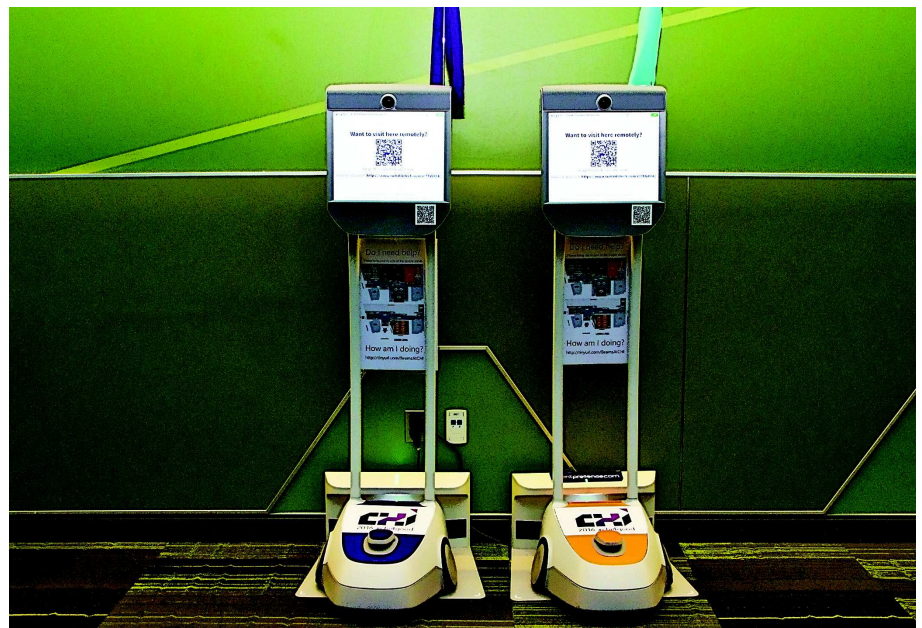
CHI16 telepresence robots at recharging station.

The technical program chair and digital accessibility chair for CHI 2014 learned that the papers-publishing company SIGCHI works with, Sheridan, offers the option of evaluating accepted-paper .pdf files for accessibility and notifying authors of violations. However, this option was not possible