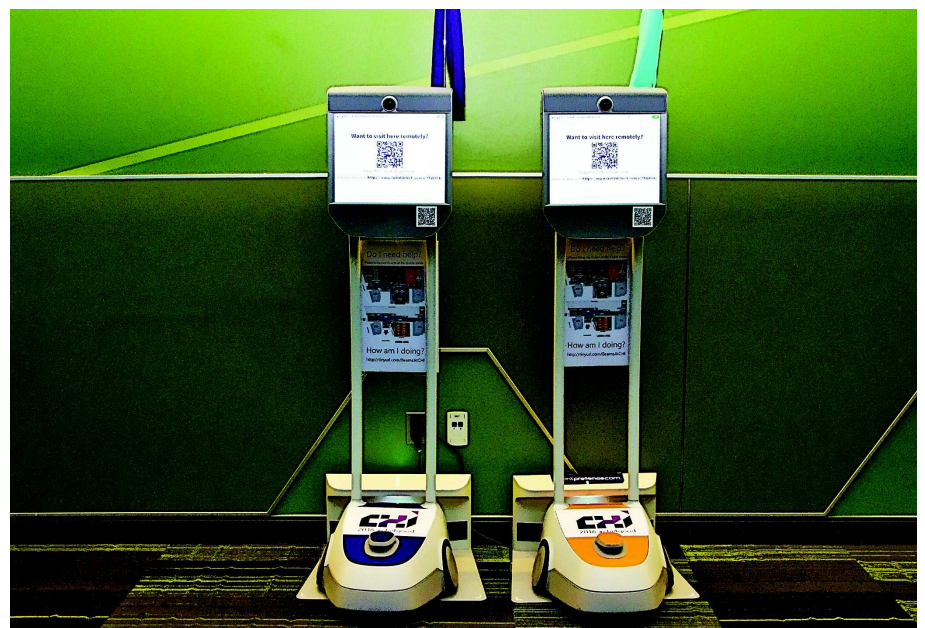
CHI16 telepresence robots at recharging station.

The technical program chair and digital accessibility chair for CHI 2014 learned that the papers-publishing company SIGCHI works with, Sheridan, offers the option of evaluating accepted-paper .pdf files for accessibility and notifying authors of violations. However, this option was not possible