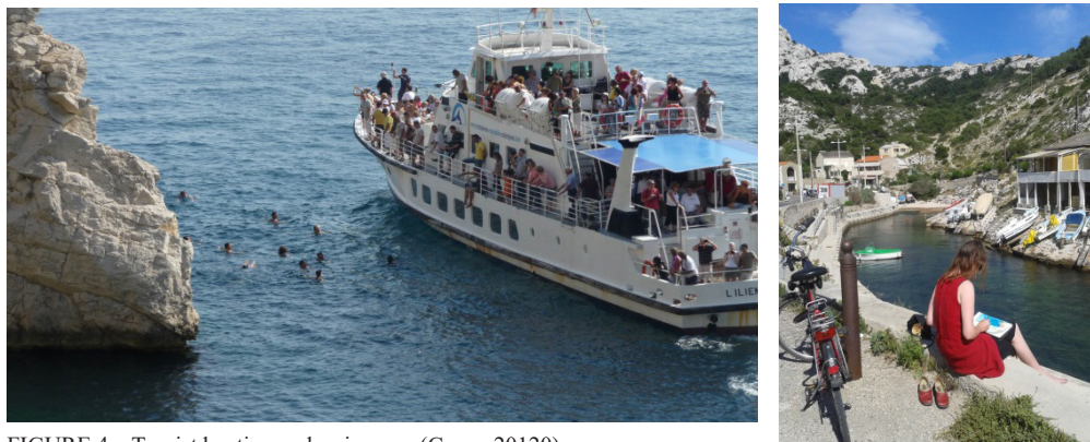
FIGURE 4 - Tourist boating and swimmers (Cresp, 20120).