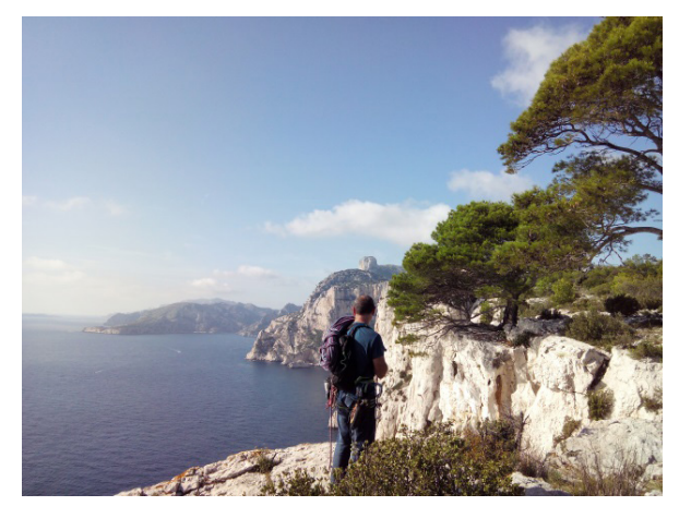
FIGURE 2 - Rock climbing (Claeys, 2015).

The attribution of merit to some activities occurred at the expense of other, less demanding activities, like tourist boating (Figure 4), picnicking and sunbathing. The allegedly "good uses" (Massena-Gourc, 1994) of the park had a relationship with nature that was primarily ascetic and contemplative (Figure 5) (Fabiani, 2001). The fact that this category was comprised almost exclusively of activities enjoyed by individuals of middle and