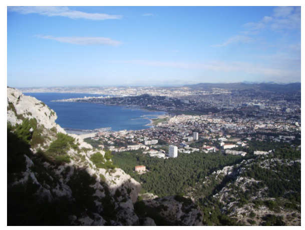
FIGURE 6 - Marseille from the National Park (Cresp, 2012).

special and experienced as "free" - was being challenged for reasons that remained incomprehensible or unacceptable. "The Calanques are our garden and we have taken care of them. We have always been able to pick things and fish... Now they're going to tell us to stop or to stay on the paths. Do you find that fair?" (a local, hunter's wife); "They're going to treat us like Indians and make a park for the tourists" (hut owner). Without addressing the issue of who owns the land, the views collected during the interviews point up several types of appropriation: "It's our Calanque [it belongs to us, hut owners]"; "It's the garden of Marseille's inhabitants" (Figure 6); "(...) The people need their Calanques, because it's their Calanques... It's freedom... You see, it's their oxygen... Freedom of movement..."; "The Calanques belong to everyone."