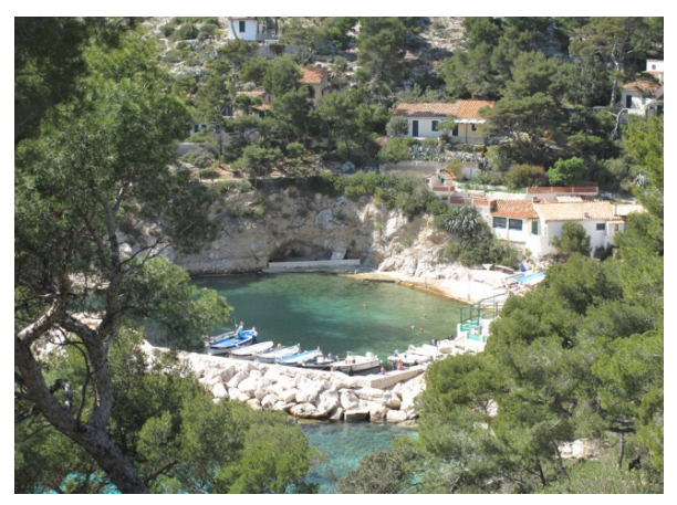
FIGURE 3 - Sormiou huts (Cresp, 2012).