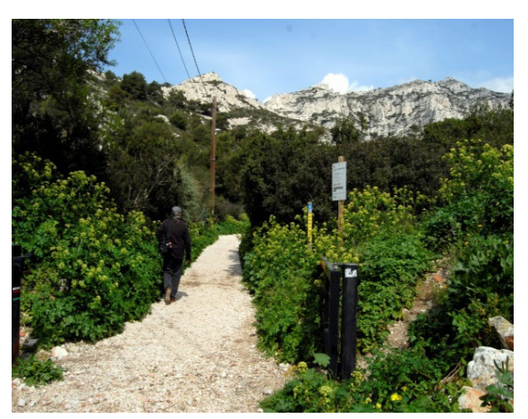
FIGURE 7 - An entrance into the national park (Deldrève, 2015).

Equality and freedom of access for all or only for the inhabitants of Marseille were mentioned but not retained as principles of justice during the consultation process, in which the definition of good use and the distribution of effort were mainly conceived, as we saw above, through the lens of tradition and merit.