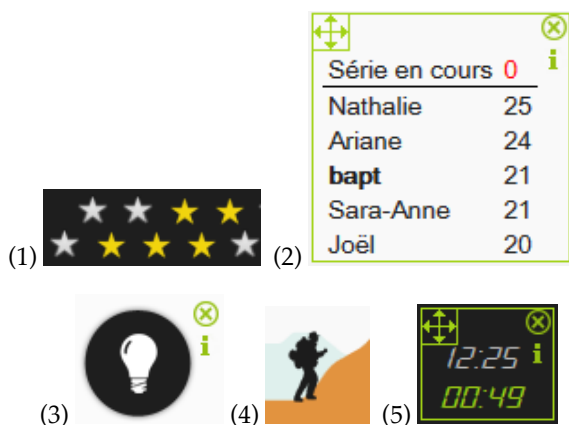
Fig. 3. Gaming features (1: stars, 2: leader board, 3: tips, 4: walker, 5: timer)

Each learner can propose a tip on how to remember a grammar rule, and obtains as feedback the number of learners interested in this tip. The fourth feature named walkers represents a walker progressing in a mountainous landscape. Each time the learner gives a correct answer, the walker takes another step. The gradient of the path is generated randomly, thus creating mountains with new shapes in order to arouse the learner's curiosity. At some points, the walker passes a flag and the learner can access a short story on the origin of a word. The fifth feature is a