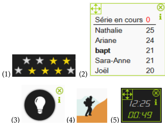
Fig. 3. Gaming features (1: stars, 2: leader board, 3: tips, 4: walker, 5: timer)

Each learner can propose a tip on how to remember a grammar rule, and obtains as feedback the number of learners interested in this tip. The fourth feature named walkers represents a walker progressing in a mountainous landscape. Each time the learner gives a correct answer, the walker takes another step. The gradient of the path is generated randomly, thus creating mountains with new shapes in order to arouse the learner's curiosity. At some points, the walker passes a flag and the learner can access a short story on the origin of a word. The fifth feature is a