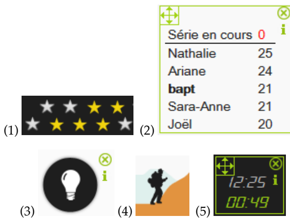
Fig. 3. Gaming features (1: stars, 2: leader board, 3: tips, 4: walker, 5: timer)

Each learner can propose a tip on how to remember a grammar rule, and obtains as feedback the number of learners interested in this tip. The fourth feature named walkers represents a walker progressing in a mountainous landscape. Each time the learner gives a correct answer, the walker takes another step. The gradient of the path is generated randomly, thus creating mountains with new shapes in order to arouse the learner's curiosity. At some points, the walker passes a flag and the learner can access a short story on the origin of a word. The fifth feature is a