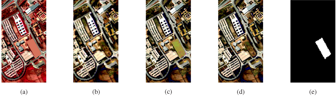
Fig. 1: Scenario 1: (a) Y_{HR}^{t_i} , (b) Y_{LR}^{t_j} , (c) \hat{X}^{t_i} , (d) \hat{X}^{t_j} and (e) \Delta\hat{X}

curve. The final result for each CD method is the averaging of all dataset ROC curves. Figure 2 presents the averaged ROC curves obtained with the four methods in two different scenarios corresponding to HR-MS/LR-HS (Scenario 1) and HR-PAN/LR-HS (Scenario 2) image pairs.